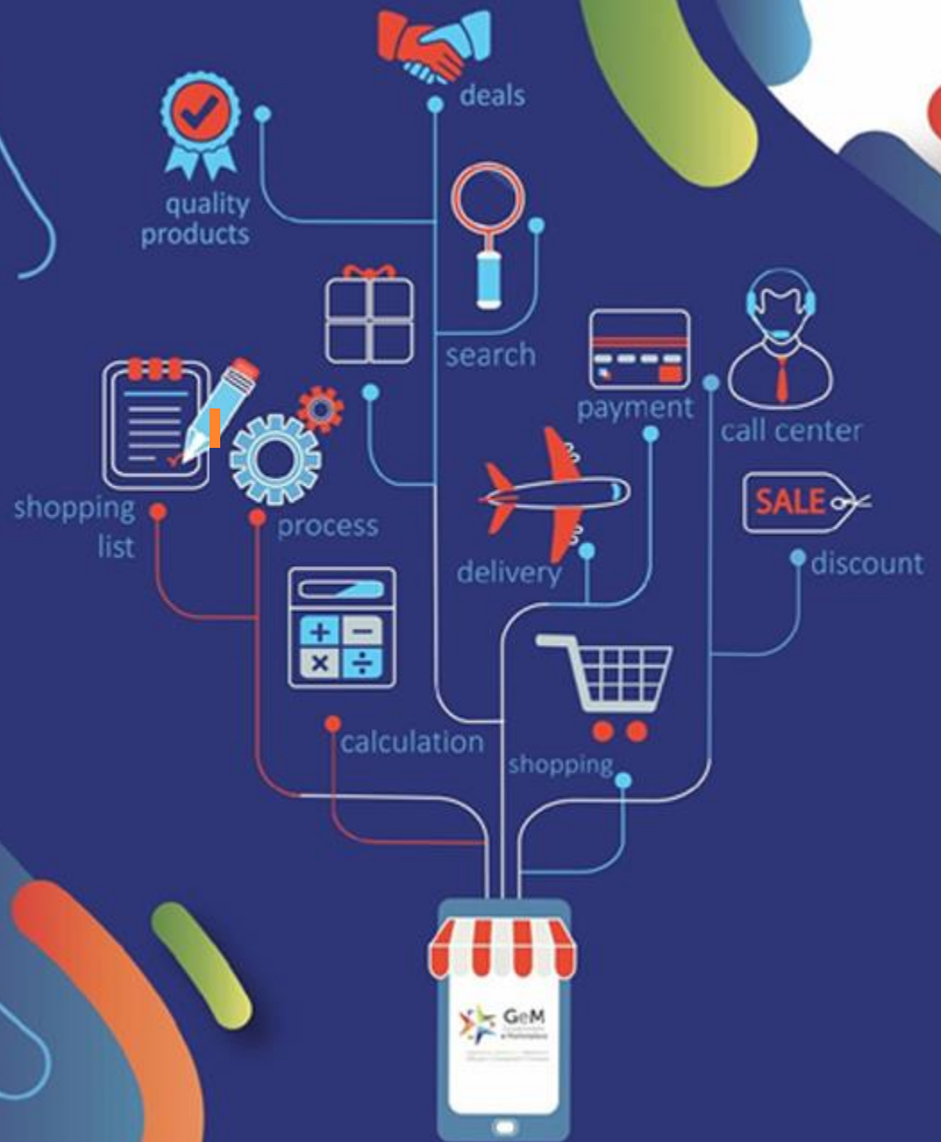
Image Upload Process